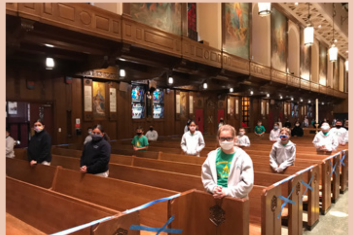
Mass looks a little different this year, but the 5th grade is happy to be back in church with their classmates.