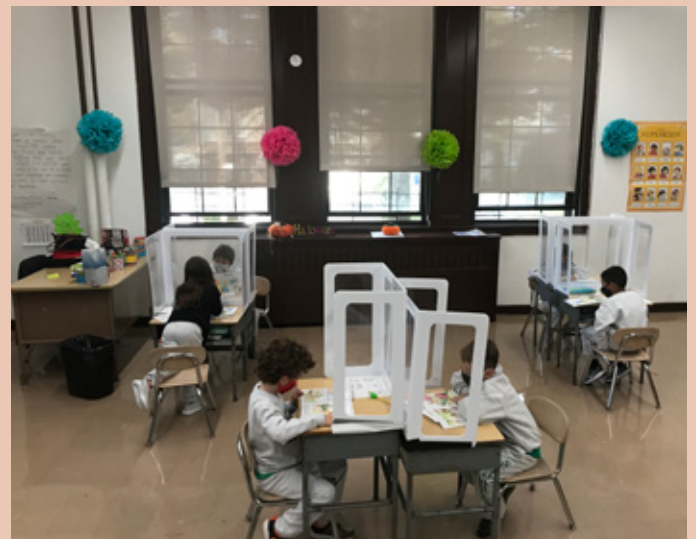
First graders take turns reading the class story to one another.