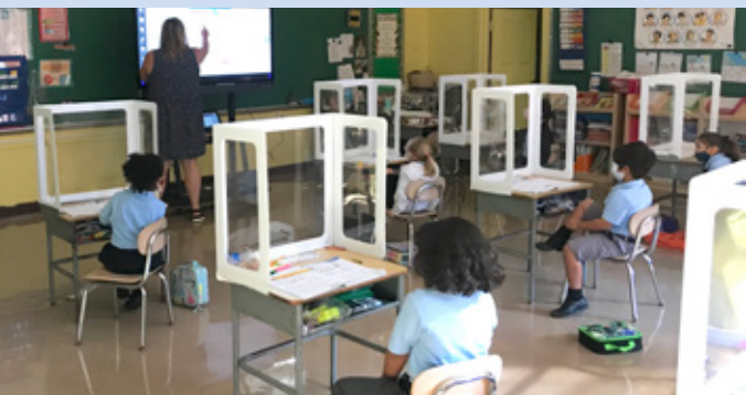
The first grade is ready for a great year of learning!