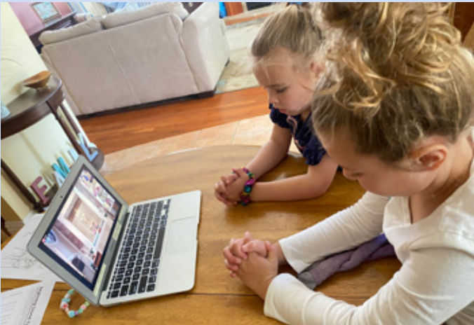
Students attended the mass of the Feast of the Ascension online, which was broadcasted live from St. Andrew Avellino Church.